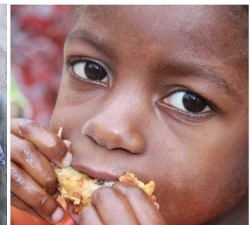
Food parcels for families