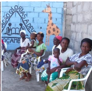
Children's health clinic