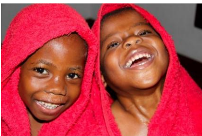
Sponsoring a child costs £20 a month

Project Moz was founded in 2008, and is a UK registered charity developed to help Mozambican people that have started out with, or ended up with, nothing. It is a UK created Christian charity that financially supports existing work being carried out in Mozambique, principally the care of orphaned and abandoned babies and children. It also helps to create and maintain community projects.